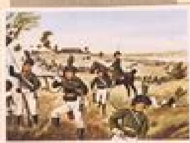
BILD 186. DIE TRUPPEN NAPOLEONS I. BEWÄHREN SICH BEI AUSTERLITZ AM 21. DEZEMBER 1805. BEI SCHNEEBURG BEI BUDAPEST AM 5. DEZEMBER 1805. Die Truppen von Napoleon I. besiegten die russischen Truppen bei Austerlitz am 21. Dezember 1805 und bei Schneeburg bei Budapest am 5. Dezember 1805.