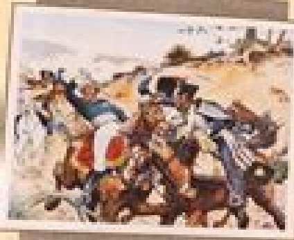
BILD 183. BELAGERUNG DES FORTS LOUIS PAR DONNAUD VON FREGOSSE BEI SAARFELD. 26. AUGUST 1800. Illustration von B. G. G. Die Belagerung des Forts Louis bei Saarlouis durch die Truppen von Donnaud von Fregosse am 26. August 1800.