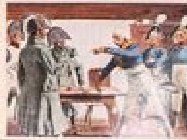
BILD 188. KAPITULATION MÜNCHENS BEI MAR-BAUD. 3. NOVEMBER 1805. Illustration von G. Bouché. Die Kapitulation Münchens bei Mar-Baud am 3. November 1805.