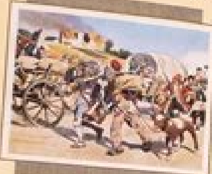
BILD 181. FRENCHISCHE REVOLUTIONÄRE KRIEGE IN DER PFALZ 1792. Illustration von G. Bouché. Die Revolutionäre besetzten die Pfalz im September 1792, um gegen die monarchistische Preussen zu kämpfen. Aber die Österreichern blieben ungenügend. So die mit russischen Hilfe wurde nur durch die Pfalz von russischen Kavallerie wieder zurückgewonnen.