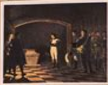
BILD 187. NAPOLEON I. AM SARG FREDERICH DES GROSSEN. 27. OKTOBER 1806. Illustration von G. Bouché. Napoleon I. am Sarg von Friedrich dem Großen am 27. Oktober 1806.