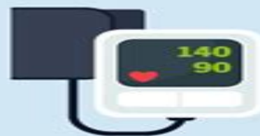
Blood pressure or heartbeat changes