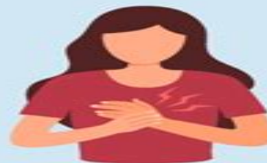
Bone pain or joint pain/ swelling/stiffness