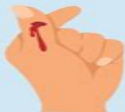
Unexplained bleeding or rashes