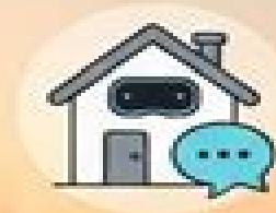
AI Chatbot services