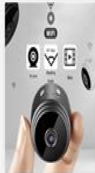
WiFi HD 1080P Mini Camera