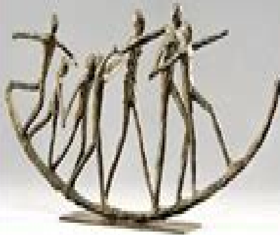
Gnomes de Minoules