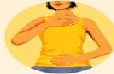
Anxiety relief meditation