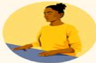
'Do nothing' meditation