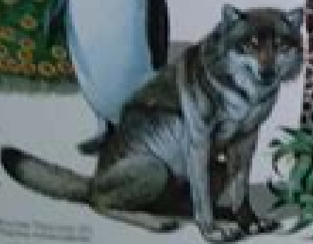
Grey Wolf North America