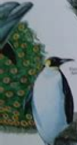
King Penguin Antarctica