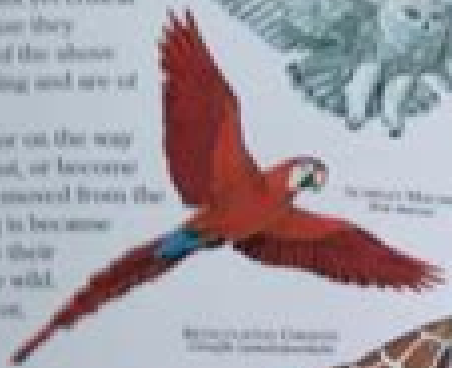
Red and Blue Macaw Paraguay