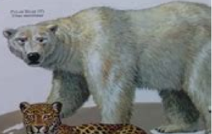
Polar Bear Arctic