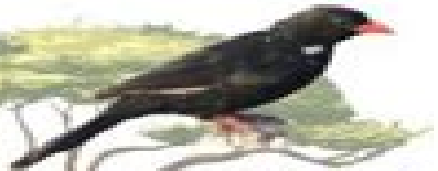
Red-billed Buffalo Weaver