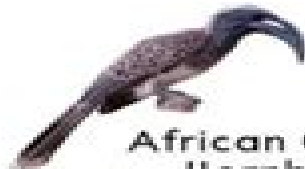
African Grey Hornbill