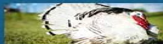
9. ROYAL PALM TURKEY