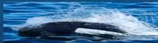
11. DALL'S PORPOISE