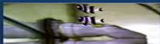
14. FOUR STRIPE DAMSELFISH