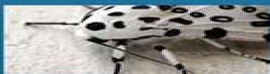
5. GIANT LEOPARD MOTH