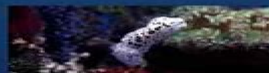
15. BLACK SPOTTED NUDIBRANCH