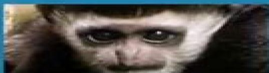
2. COLOBUS MONKEY