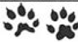
FISHER - 2 1/4"