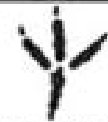
CROW - 2 1/2"