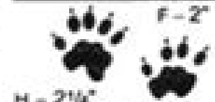
WOODCHUCK H - 2 1/4" F - 2"