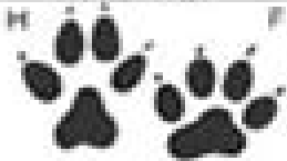
DOG - 2 1/4" to 4"