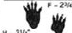
PORCUPINE H - 3 1/4" F - 2 1/4"