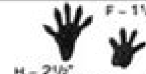
MUSKRAT H - 2 1/2" F - 1 1/2"