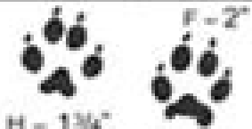
GRAY FOX H - 1 1/4" F - 2"