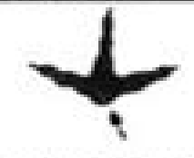
RUFFED GROUSE - 2"