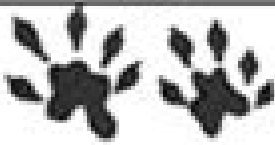
OTTER - 1 1/2"