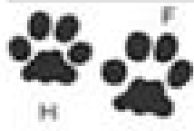
BOBCAT - 1 1/2"