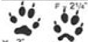
RED FOX H - 2" F - 2 1/4"