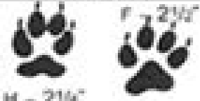
COYOTE H - 2 1/4" F - 2 1/2"