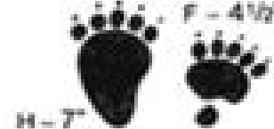
BLACK BEAR H - 7" F - 4 1/2"