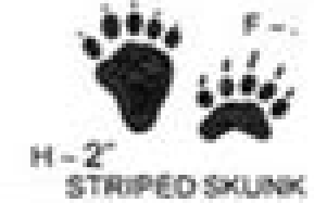
STRIPED SKUNK H - 2" F - 2"