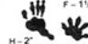
OPOSSUM H - 2" F - 1 1/2"