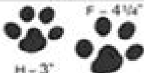
LYNX H - 3" F - 4 1/4"