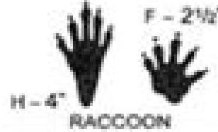
RACCOON H - 4" F - 2 1/2"