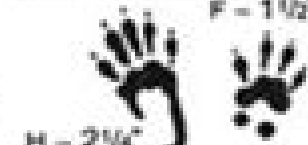
GRAY SQUIRREL H - 2 1/4" F - 1 1/2"