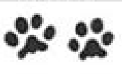
HOUSE CAT - 1 to 2"