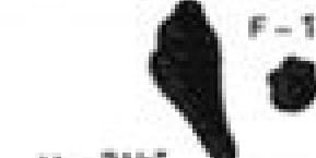
COTTONTAIL RABBIT H - 3 1/2" F - 1"