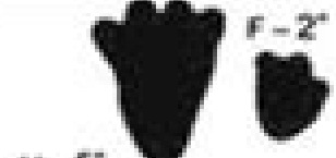
SNOWSHOE HARE H - 5" F - 2"