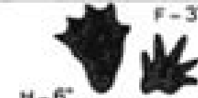
BEAVER H - 6" F - 3"