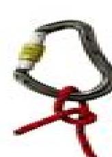
HALF HITCH KNOT