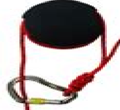
TENSIONLESS HITCH KNOT