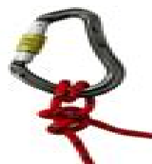
ROUND TURN AND TWO HALF HITCHES KNOT