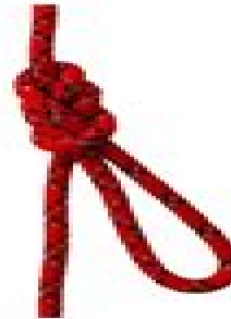
DIRECTIONAL FIGURE EIGHT KNOT