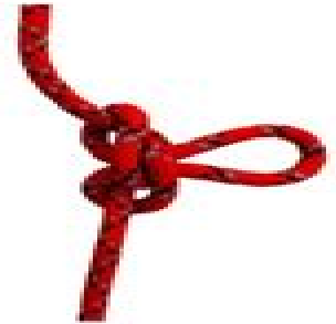
ALPINE BUTTERFLY KNOT