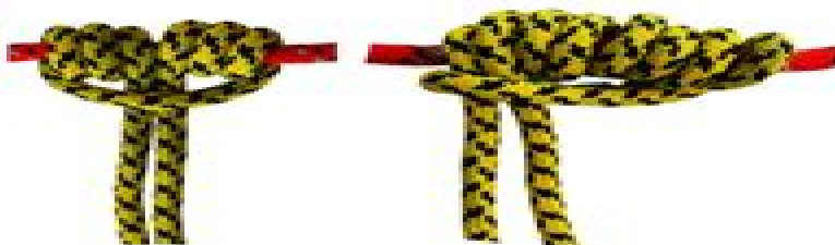
PRUSIK HITCH KNOT