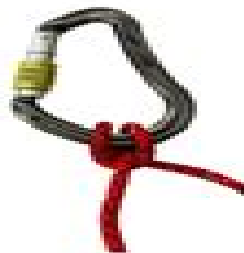
CLOVE HITCH KNOT