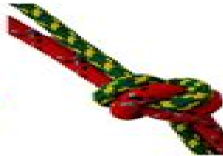
EUROPEAN DEATH KNOT