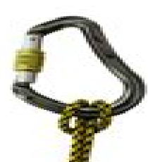
GIRTH HITCH KNOT