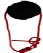
TRUCKER'S HITCH KNOT