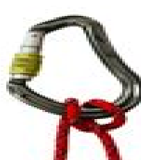
MUNTER HITCH KNOT