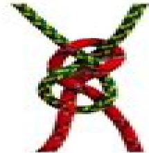
CARRICK BEND KNOT