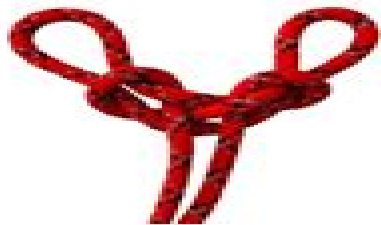
SPANISH BOWLINE KNOT