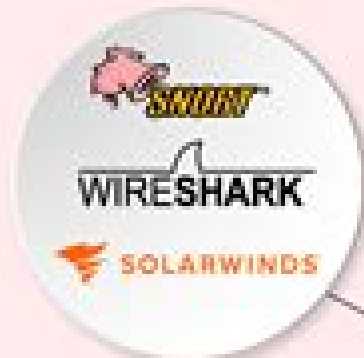
Network Security Monitoring Tools