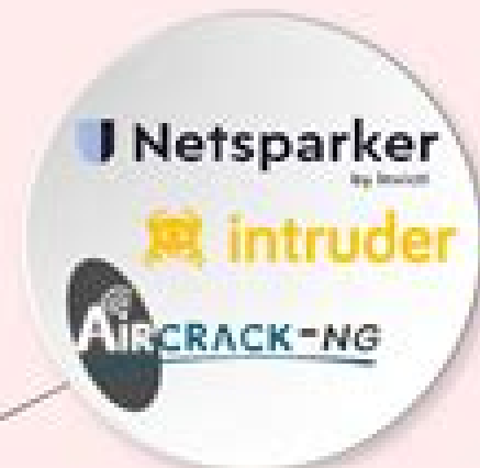
Web Vulnerability Scanning Tools