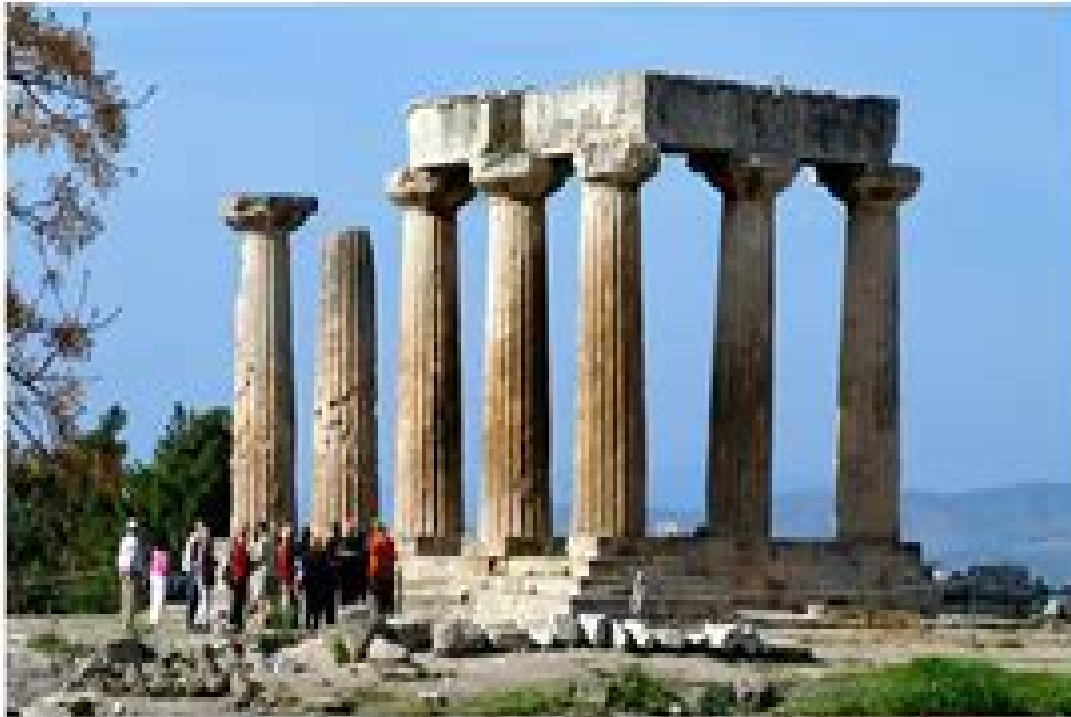
Temple of Apollo, Ancient Corinth, Greece. Built in the Doric style in the mid-sixth century BCE. Seven of the original thirty-eight Doric columns remain.

Doric order - DAW-rik: Architectural style presumably developed on the Greek mainland and in southern Italy and Sicily. Although the Doric order is traditionally credited with slightly pre-dating the Ionic order, both orders were established by the end of the seventh century. Doric columns are slightly tapered, simple and sturdy and have no base. Shallow, parallel grooves (flutes) run from the bottom to the top of the shaft. The Doric capital consists of two parts, a round echinus and a square abacus. Above the capital is the architrave consisting of an unadorned beam supporting a frieze of alternating triglyphs (vertical, weight supporting blocks with three vertical grooves) and metopes (non-load bearing panels either decorated with relief sculpture or left plain). A simple cornice molding at the top of the architrave extends to protect the parts below from rain.