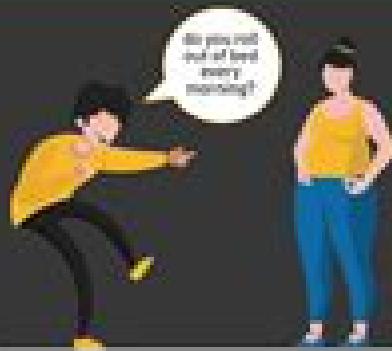
PLAYING ON INSECURITIES