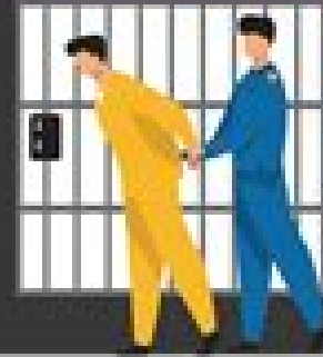
ISOLATING THE VICTIM