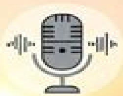
AI Property management