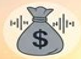
AI content creation