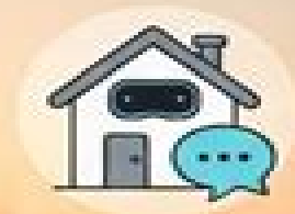
AI Chatbot services