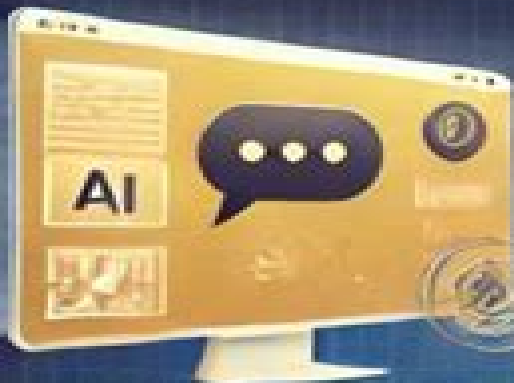
CUSTOMER SUPPORT CHATBOT