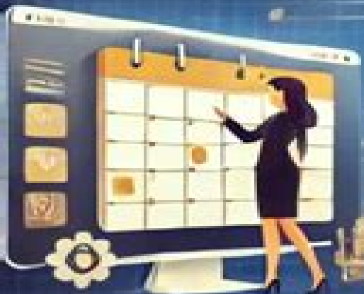
VIRTUAL ASSISTANT navigating a calendar