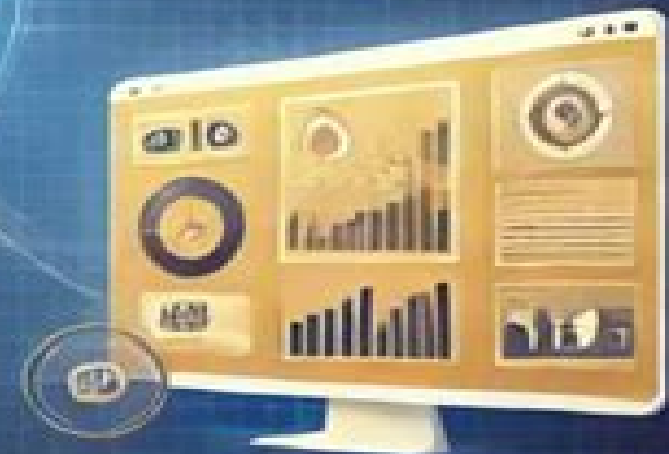
DESIGN ASSISTANT suggesting layouts