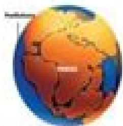
1 THE EARTH'S CRUST IS THINNING AND BREAKING INTO FRAGMENTS.

Over time the continents, which are part of tectonic plates that drift across the Earth's surface at the rate of a few centimeters per year, have shifted and separated into parts of the world we know today. When tectonic plates are pushed together, they can create new mountain ranges. When the plates separate, a rift forms. The rift eventually fills with water, forming the ocean. The rift eventually fills with the salt-laden water from the other plates, creating a new ocean basin. The rift eventually fills with the salt-laden water from the other plates, creating a new ocean basin. The rift eventually fills with the salt-laden water from the other plates, creating a new ocean basin.