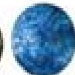
3 THE EARTH COOLED AND THE ATMOSPHERE BEGAN TO FORM.