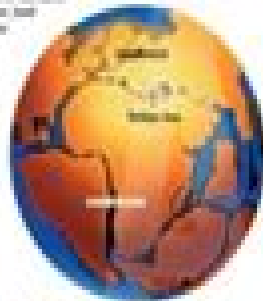
2 THE PLATES ARE MOVING APART, FORMING A RIFT.