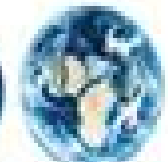
4 THE EARTH COOLED AND THE CONTINENTS BEGAN TO FORM.