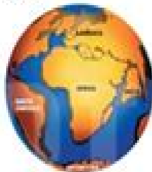
3 THE RIFT FILLS WITH WATER, FORMING A NEW OCEAN BASIN.