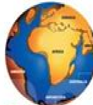
5 THE EARTH COOLED AND THE CONTINENTS BEGAN TO FORM.