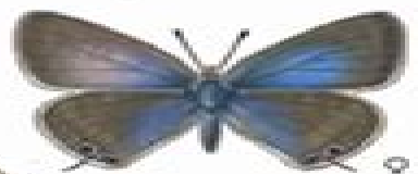
51. Long-tailed Blue Lampides boeticus