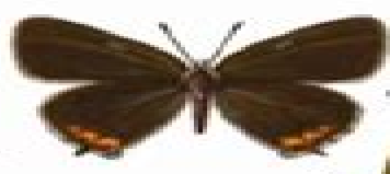
50. Black Hairstreak Satyrium pruni