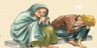
Ignorance & Want