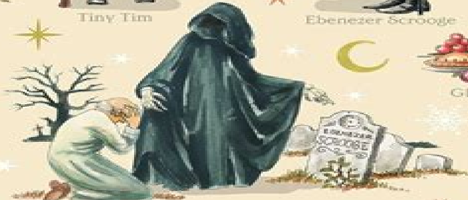
Ghost of Christmas Yet to Come