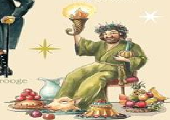
Ghost of Christmas Present