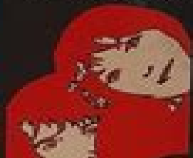
Sonny and Cher