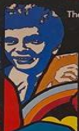
The Everly Brothers