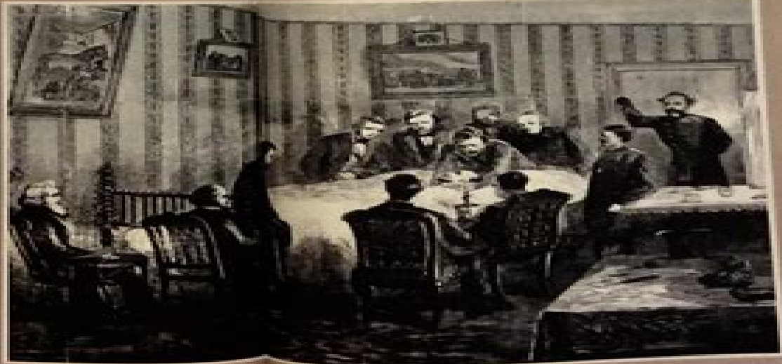
The Union's military strategy in 1864.

The Union's military strategy in 1864 was a combination of offensive and defensive maneuvers. Sherman's march to the sea was a bold move that caught the Confederates off guard. The Union's victory at the Battle of Atlanta was a significant morale booster for the North. The Union's strategy was to wear down the Confederacy through a series of offensives and to cut off their supply lines.