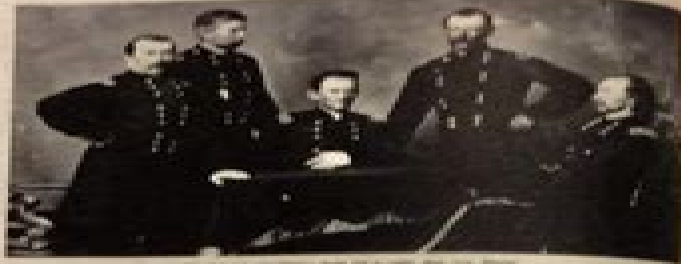
General Sherman and his staff, 1864.