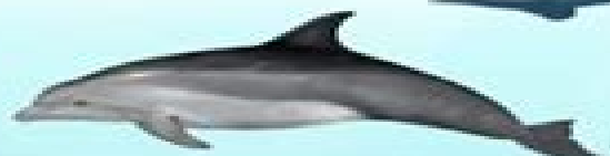
Common Bottlenose Dolphin