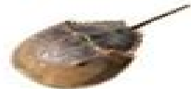
Atlantic Horseshoe Crab