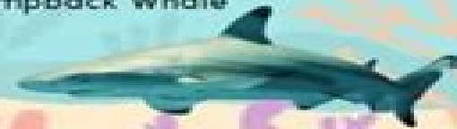
Blacktip Reef Shark