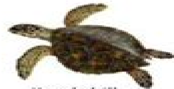
Hawksbill Sea Turtle