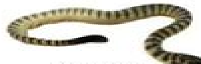
Shaw's Sea Snake