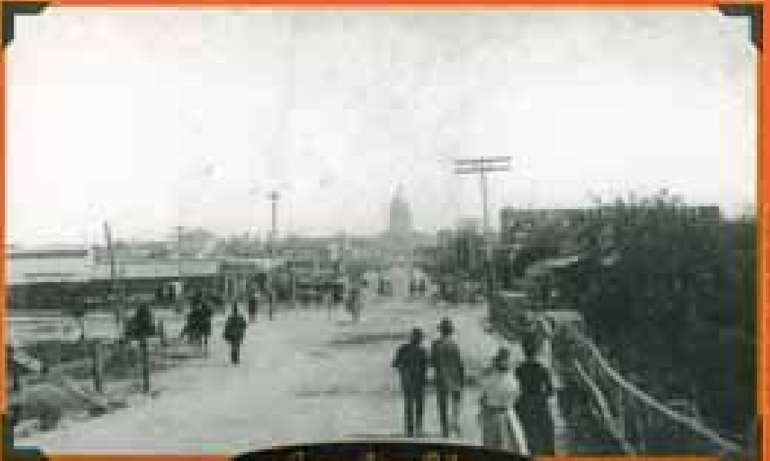
Original Austin Bridge