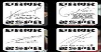
Photocard 55*85(mm) / Random 1 Out of 4