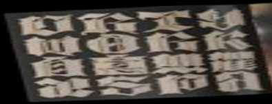
Accordion Fold Paper 122*117(mm) / 1 type