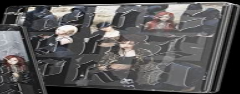
Booklet 123*120(mm) / 10p / 2 Types