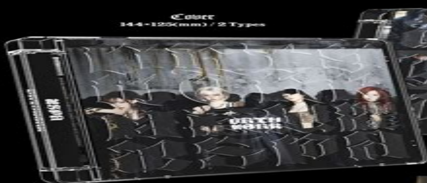
CD Case 144*125(mm) / 2 Types