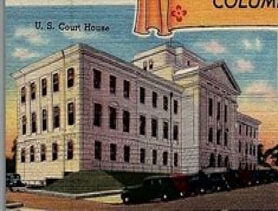
U. S. Court House