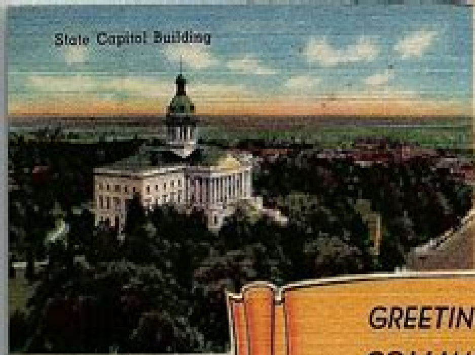
State Capitol Building