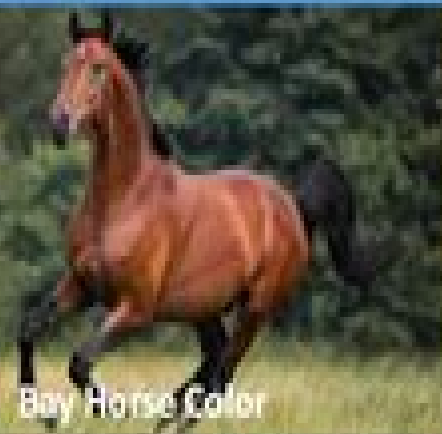
Bay Horse Color