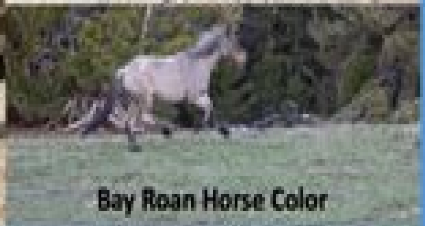
Bay Roan Horse Color