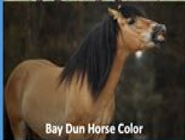
Bay Dun Horse Color