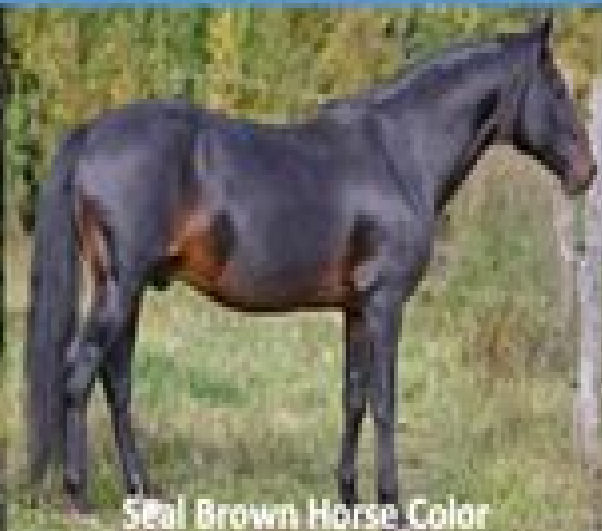
Seal Brown Horse Color