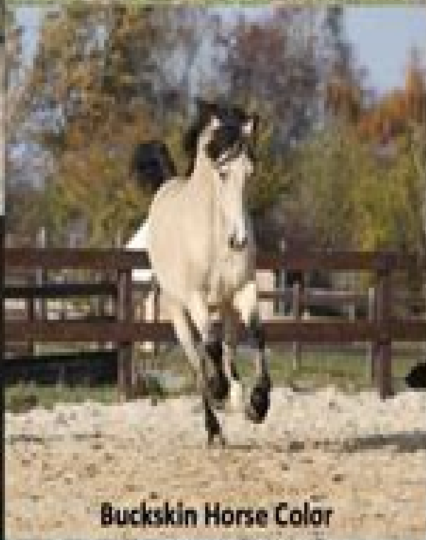
Buckskin Horse Color