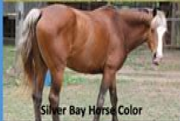
Silver Bay Horse Color