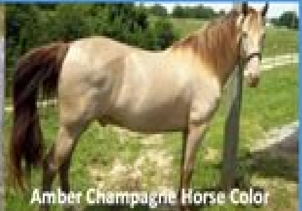
Amber Champagne Horse Color