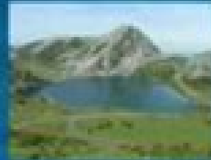
LAGOS Y LAGUNAS