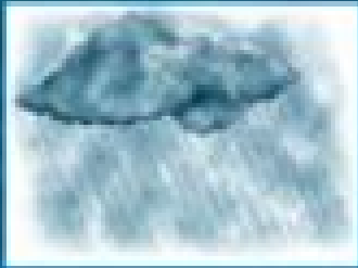
EN LAS NUBES