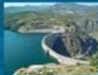
EMBALSES Y PANTANOS