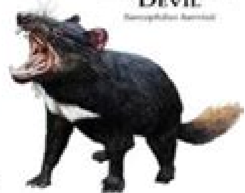
TASMANIAN DEVIL Sarcophilus harrisii