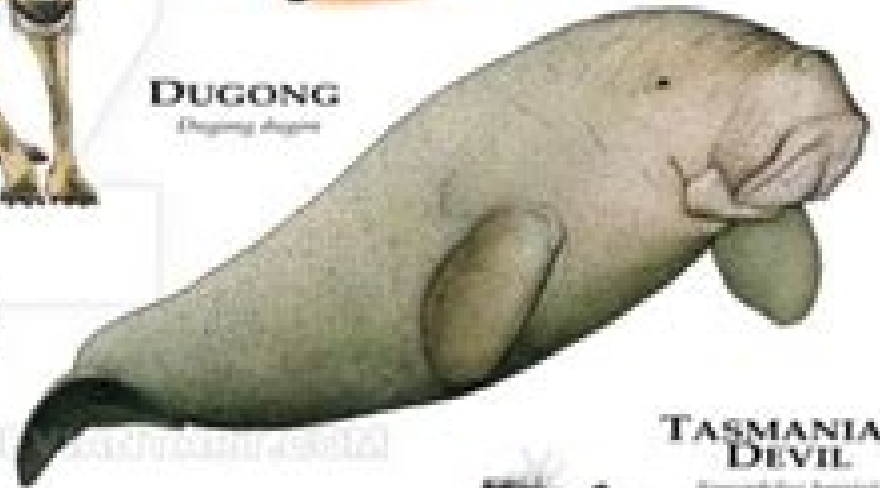
DUGONG Dugong dugon