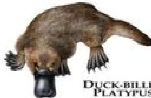
DUCK-BILLED PLATYPUS Ornithorhynchus anatinus