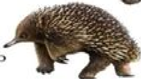
SHORT-BEAKED ECHIDNA Tachyglossus aculeatus