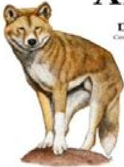
DINGO Canis lupus dingo