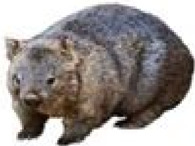
COMMON WOMBAT Vombatus ursinus