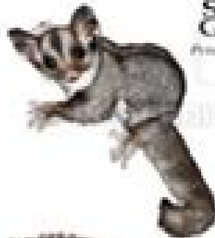
SUGAR GLIDER Pteropus sugar glider