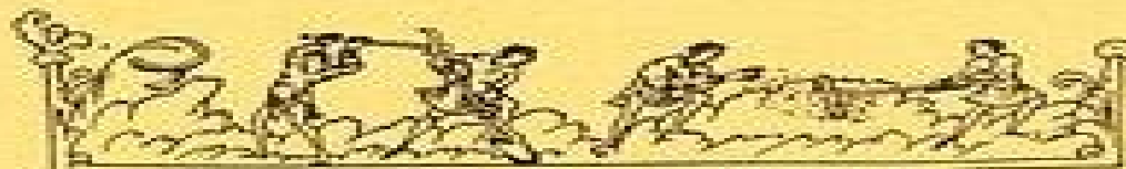
MARCH. BREAKING UP SOIL—DIGGING—SOWING—HARROWING.