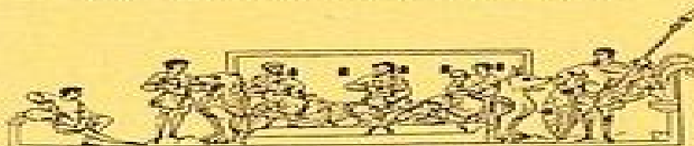
APRIL. FEASTING. Domesday Catalogue Calendar. All. 1086. Vol. 1. 11.