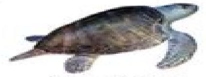
Olive Ridley Sea Turtle