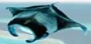
Reef Manta Ray