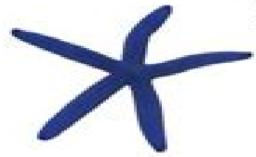
Blue Sea Star