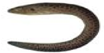
Giant Moray Eel