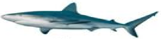
Caribbean Reef Shark