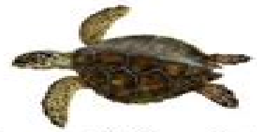
Hawksbill Sea Turtle