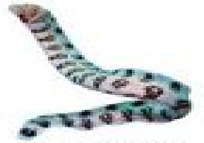
Snowflake Moray Eel