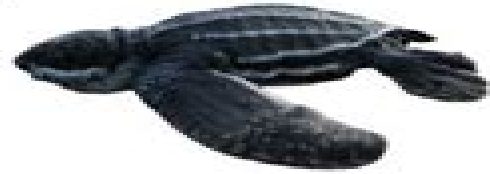
Leatherback Sea Turtle