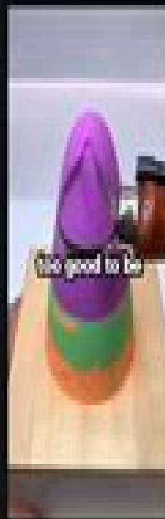
too good to be