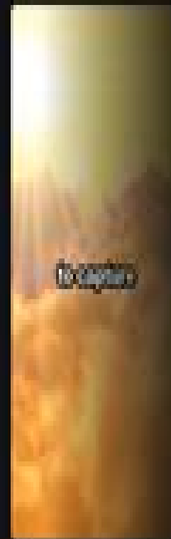
to capture a