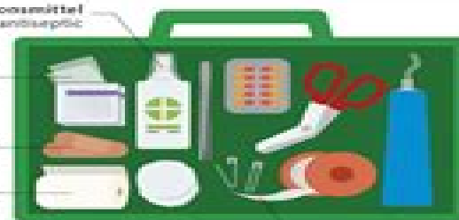
das Heftpflaster adhesive tape