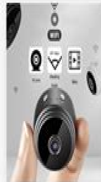
WiFi HD 1080P Mini Camera