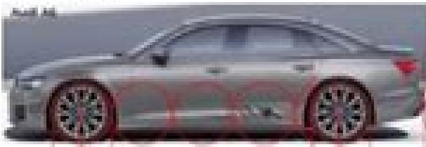
2-Height and Overhangs