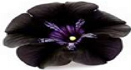
black velvet petunia