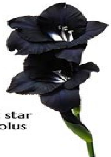
black star gladiolus