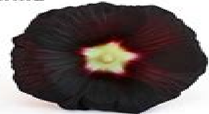
black magic hollyhock