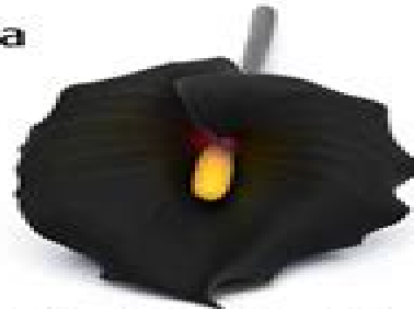
Black Calla lily