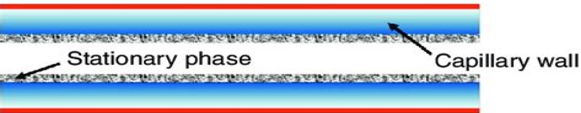
(b) Monolithic capillary column