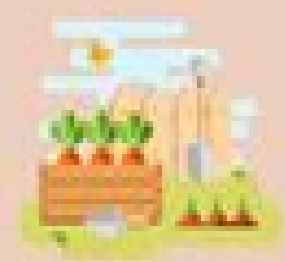
Sell Home-Grown Produce