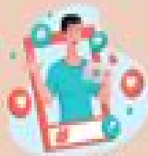
Become an Influencer