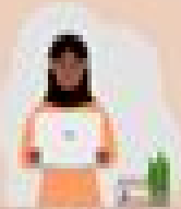
Sell an online course