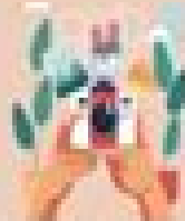
Sell Stock Photos