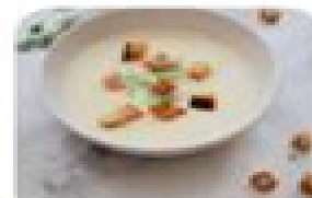
Soup 3 (450ml)