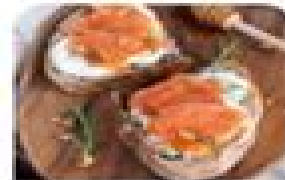
Appetizer 3 (450g)