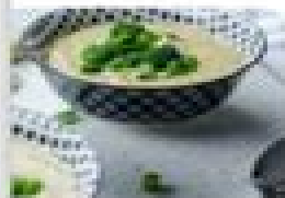
Soup 2 (450ml)