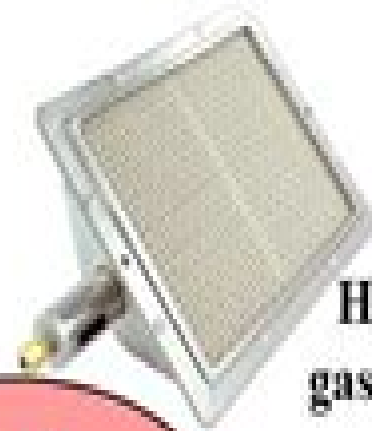
Heating gas burner