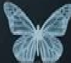
THE LAST OF US