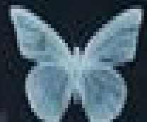
YOUR MIND, YOUR LIFE