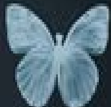
THE TALK OF THE TOWN