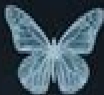
AT THE MUSEUM