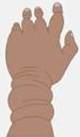
AMNIOTIC BAND SYNDROME