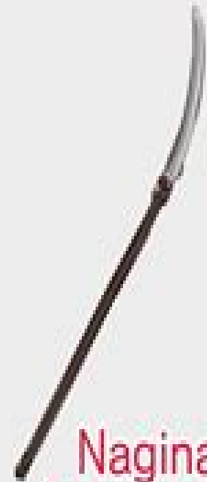
Naginata (Pole Sword)

Spears to be thrown. Used with the aim of destroying shields, and designed exclusively for cutting deep into them.