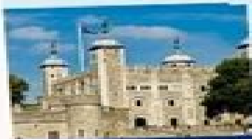
STEP BY STEP GUIDE