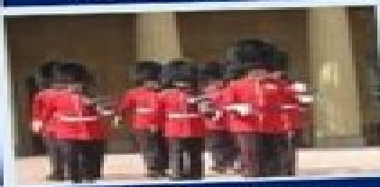
TICKETS & TOURS