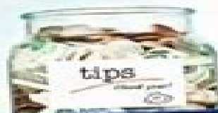
TIPS + FAQs