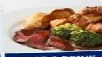
FOOD & DRINK