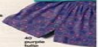
40 purple tulip