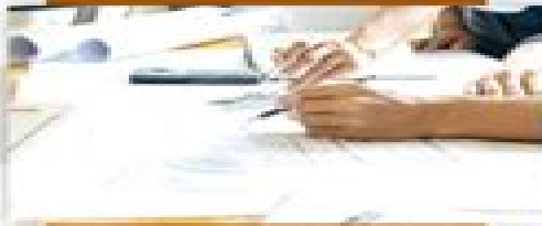
Commit to Problem Solving