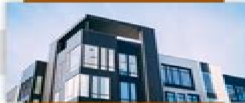
Have Some Flair