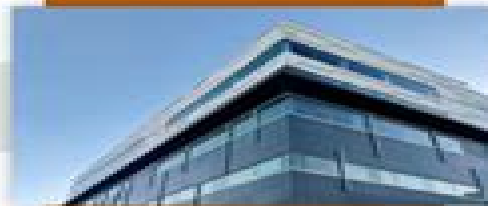
Be True to Your Principles