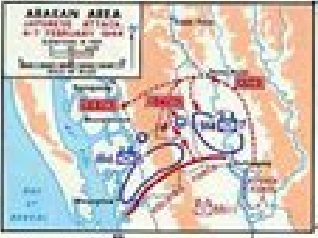
CHINA-BURMA, 1941 THIRD BURMA CAMPAIGN Initial Engagements, November 1943- May 1944