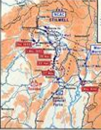
MYITTHINA AREA STEWELL'S CAMPAIGN, OCTOBER 1943-MAY 1944