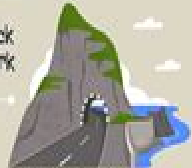
The Black Arch