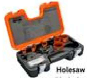
Holesaw Blade Set