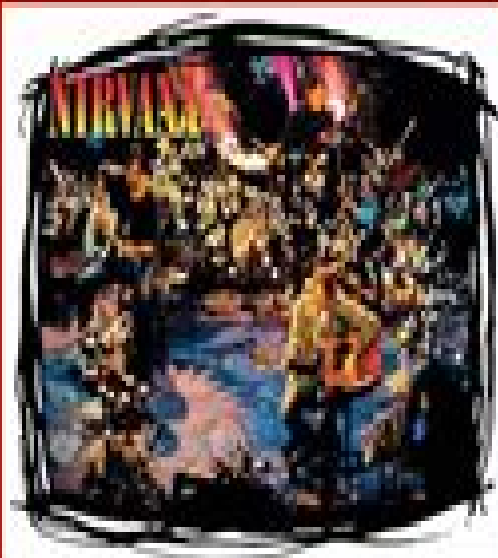
MTV UNPLUGGED IN NEW YORK