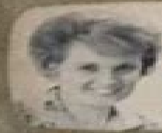
Pour vous : CATHERINE LANGEAIS Confidences