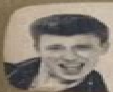
A 19 ans : JOHNNY HALLDAY millionnaire