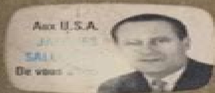
Aux U.S.A. SAL De vous...